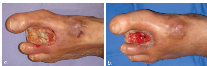
Figure 3. Diabetic foot ulcer; a. The debrided wound is shown prior to commencing topical wound oxygen therapy. b. The wound showed formation of healthy granulation tissue at 4 weeks after the commencement of oxygen therapy.