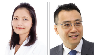
Authors: Hitomi Sano, Shigeru Ichioka

Topical wound oxygen therapy (TWO) is widely used in North America and Europe. We initiated a clinical trial in 2010 to introduce this therapy into Japan; this involved six patients with chronic ulcers who underwent TWO. Pre- and post-treatment transcutaneous oxygen tension (TcPO 2 ) values were evaluated at the periwound area. All cases showed increased TcPO 2 values after TWO. In four cases, the size of the wound was reduced following treatment and there was formation of healthy granulation tissue. Wounds were completely closed by skin grafting in three of these four cases and healed spontaneously in one case. One of the cases is presented in detail here.