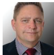
Author: Tom Wild, General Surgeon; Wound Center Dessau-Rosslau, Department of Dermatology, Dessau Municipal Hospital Dessau, Germany